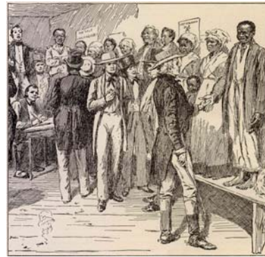
Slave Auction in New Orleans

Traders smuggled slaves into Louisiana by way of the state's many bayous and swamps. Rising slave prices in the 1850s produced an increase in this illicit traffic and prompted some white southerners, including many from Louisiana, to petition the federal government for repeal of the African slave trade ban. This petition was unsuccessful.